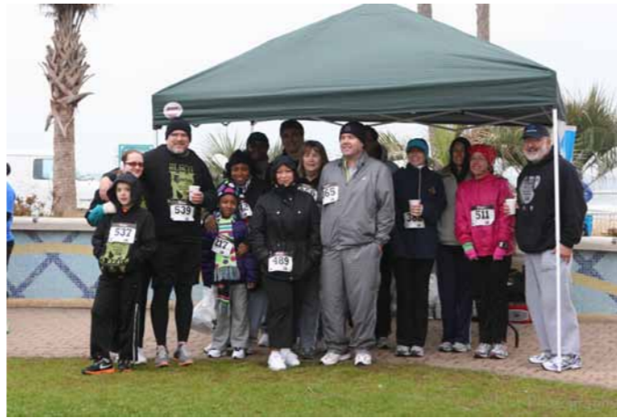
Members of the VT Milcom Wounded Warriors Team.

VT Milcom was extremely excited about the opportunity to support the Third Annual Spartyka Wounded Warrior 5K held on the boardwalk at the Virginia Beach oceanfront on Saturday, March 26. The race was part of a five-location event as people ran and walked in Washington, New York, Afghanistan and Kuwait, all in support of the Wounded Warrior Project.