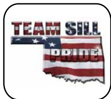
Supporting Fort Sill