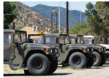
Humv fleet Fort Huachuca, AZ.

During the week of February 22 – 25, 2011, the Maintenance Division went through an intense and thorough technical inspection of the National Training Center and 86th Signal Battalion Left Behind Equipment by TACOM out of Joint Base Lewis-McChord, Washington.