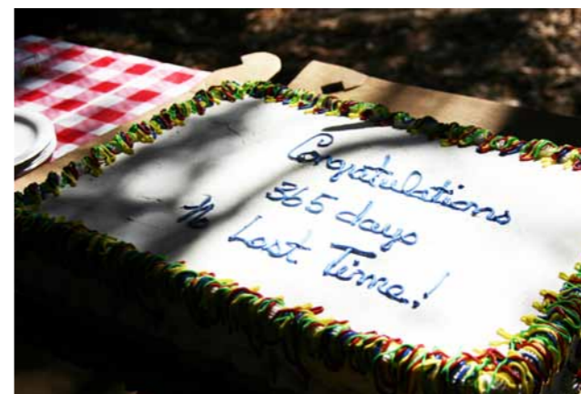
A sweet reward for staying safe.

Hats off to the the employees of Kings Bay who keep safety the highest concern and continue to operate without any lost day injuries.