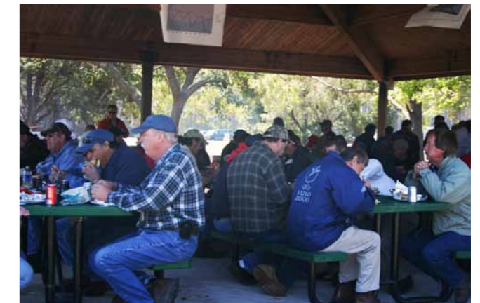
A great meal for the employees and benefit for local charities.

For more information about company safety visit https://portal.vt-group.com .