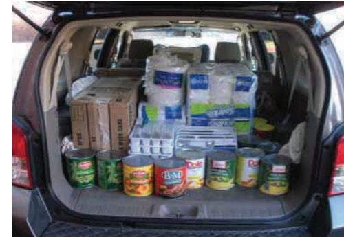
A carload of donations.

The employees at Huntsville and Madison know that in tough economic times making ends meet becomes challenging for more and more families. Organizations that provide critical support for those in need often become stretched to the limits of their resources.