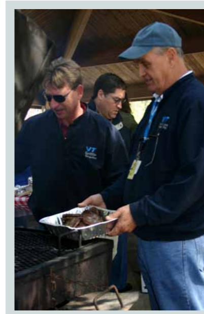
Employees enjoy great BBQ pork.

On February 19, VT Group's Kings Bay location passed a major milestone, achieving one year without a lost-time accident. This major accomplishment can be attributed to the competence, professional skills and active role taken by the entire site's employees and staff. A number of initiatives placed an increased focus on safety awareness, making a safety mindset a way of life at the site. Studies show there is a direct correlation between a safe workplace and a successful company. It is critical that we continue this focus and achieve our goal of Home Safe Every Day .