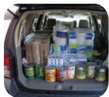
A Load of Hope