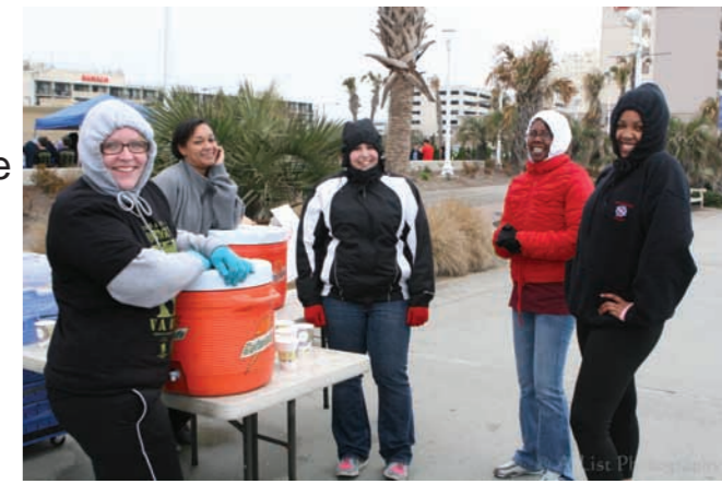
VT Milcom volunteers.

As people crossed the finish, volunteers provided water, bananas and cookies, while VT runners and walkers continued to cheer for those yet to cross the finish line. It truly brought a feeling of joy throughout our community to know that we took part in something special. For more information on the Wounded Warrior Project, visit www.WoundedWarriorProject.org .